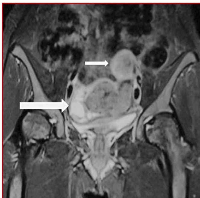
Figure 1. Pelvic magnetic resonance imaging of the case revealed a myoma in uterus (small arrow) and multiple hemorrhagic cysts in ovaries (big arrow)

ameter and tortuosed at the level where it crossed the iliac artery. When peritoneum was opened in order to see the distal part of the left ureter, it was observed that the left ovary and the adnexial structures were not grown, but a rudimentary horn and a myoma of 5 cm in diameter on the left side of the uterus were seen. First of all, horn excision and myomectomy were applied. The solid mass and the related distal part of ureter were excised completely and ureteroureterostomy was performed via a double J (DJ) catheter. Nephrostomy catheter was extracted after the ureterovesical passage was seen on antegrade ureterography on the 7th postoperative day (Figure 2). One month later there was no dilation in the left collecting system in sonographic evaluation and DJ catheter was extracted. Her intravenous urography was normal on the 45th postoperative day with nephrogram and pyelogram phases and ureterovesical passage. The rudimentary horn revealed a regular myometrium, the excised myoma of uterus was reported as leiomyoma and the fibrotic mass was an endometriosis externa on the pathologic evaluation. The mercapto acetyl triglycine (MAG-3) scintigraphy on the postoperative 3rd month reported that the left kidney has a 32% of the total renal function.