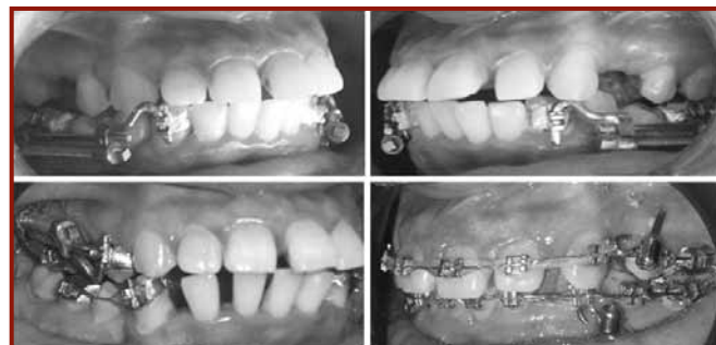
Figure 2. Rapid canine distalization and use of skeletal anchors during the leveling phase and retraction of incisors