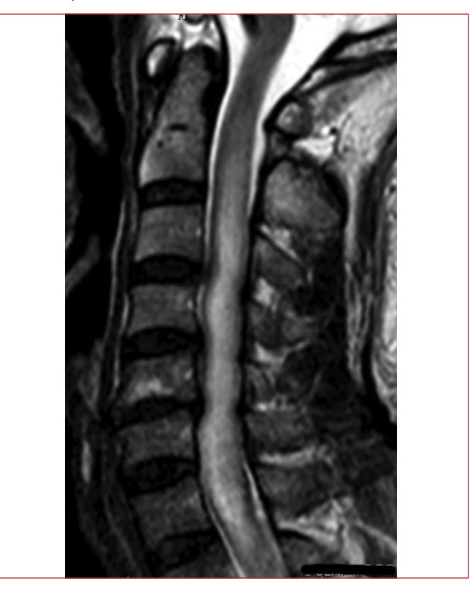
Figure 2. T2-W sagittal magnetic resonance imaging of a patient with cervical intradural intramedullary tumor. The patient underwent surgical treatment and the histological diagnosis was anaplastic astrocytoma

Spinal tumors are rare malignancies that can seldom be fatal but usually cause serious morbidity (2). The spine and spinal cord are the most common sites of neoplasia after the brain in the CNS. However, not all spinal tumors have the same characteristics (3). They are a heterogeneous group of tumors (1). Therefore, classifications were made according to different characteristics. The most accepted classification is the classification based on the location of tumor. Spinal tumors are divided into two as intradural and extradural according to their relationship with the dura mater. Intradural tumors are tumors located within the dura mater and have no direct relationship with the spine and vertebrae. Extradural tumors are tumors